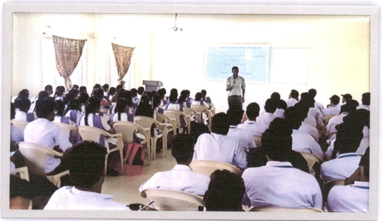
Students attending the programme “Seminar on Protect Girl Child- Maintain Gender Equity”